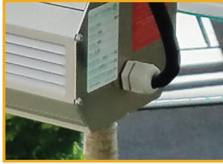
Industrial and Institutional Electric Lighting Fixtures (S1C Code 3646)