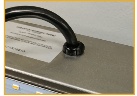
Lighting Equipment, not elsewhere classified (S1C Code 3648)